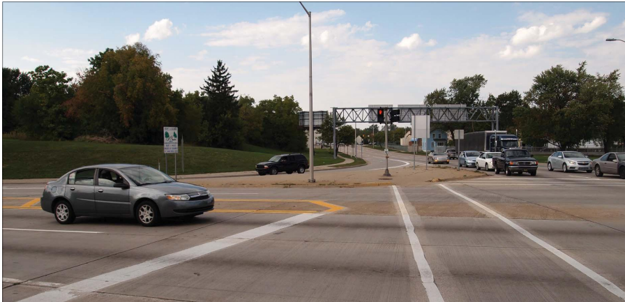
View Looking North on Woodward at Huron