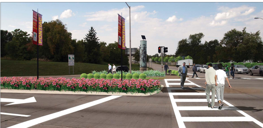
View Looking North on Woodward at Huron