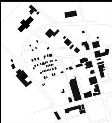
Existing Figure Ground