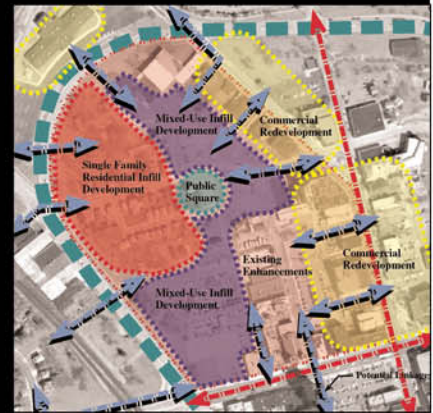
Neighborhood Redevelopment Concept