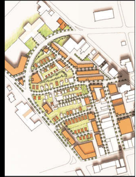
Lafayette Neighborhood Masterplan

The Lafayette Neighborhood Masterplan is a multi-street, urban design and infill housing development. The project consists of single family homes, duplexes, townhouses, and live-work units and will expand the options for buyers beyond the existing housing. This infill strategy approach focuses the development effort and will build off of the existing character in the area.