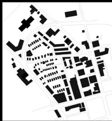
Proposed Figure Ground