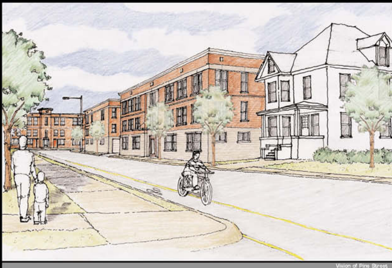
Vision of Pine Street